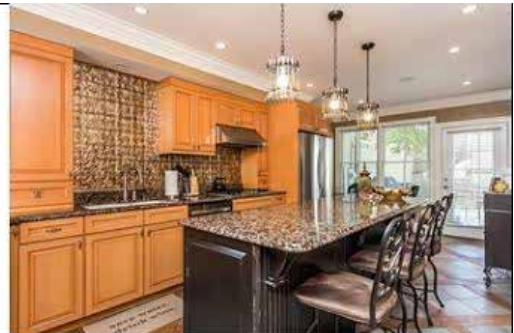
621 E. Clement St, Federal Hill $425,000 3Bed/3.5Bath