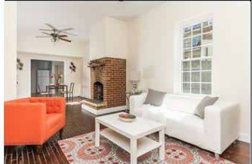
829 S. Charles St, Federal Hill $260,000 2Bed/1.5Bath