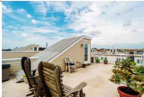
1312 Richardson St, Locust Point $459,000 3Bed/3.5Bath