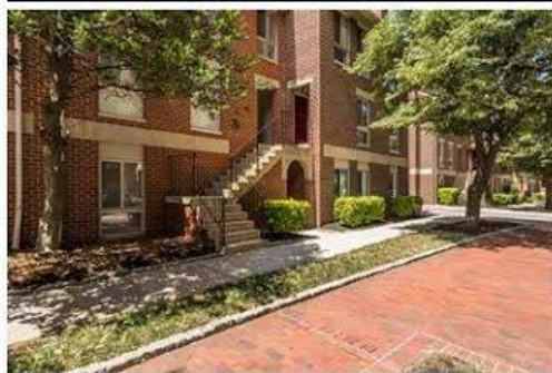
534 S. Charles St, Otterbein $229,900 2Bed/2Bath