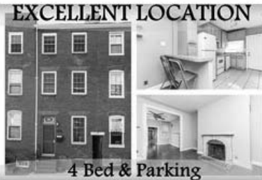
4 Bed & Parking

1253 William St, Federal Hill $379,900 4Bed/2.5Bath