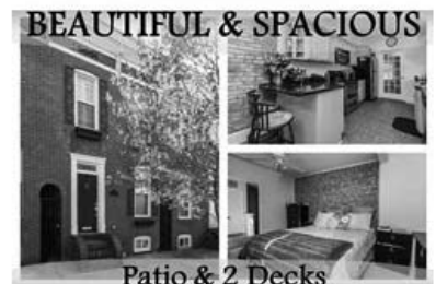
Patio & 2 Decks

2533 Fleet St, Canton $314,900 3Bed/2Bath