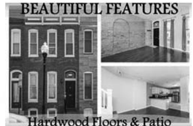
Hardwood Floors & Patio

1253 William St, Federal Hill $379,900 4Bed/2.5Bath