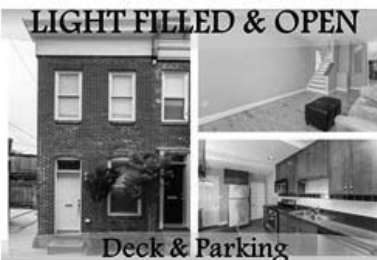
Deck & Parking

9 E. Randall St, Federal Hill $300,000 2Bed/2.5Bath