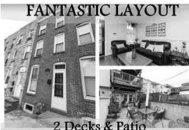
2 Decks & Patio

1045 Riverside Ave, Federal Hill $329,900 2Bed/2Bath