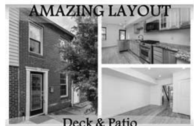
Deck & Patio

32 S. Castle St, Butchers Hill $275,000 2Bed/2Bath